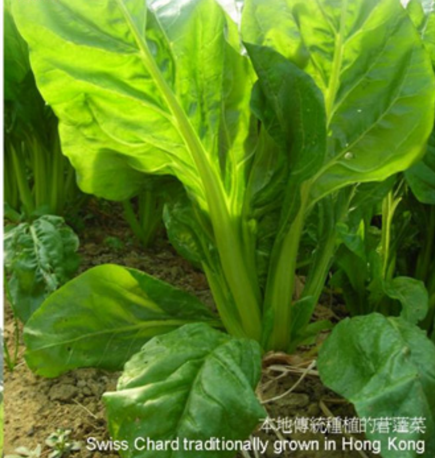
本地傳統種植的莧菜 Swiss Chard traditionally grown in Hong Kong

莧菜（入藥叫出莧蓬兒，譯自波斯文 Chugurdan）、莖菜，以往常用作豬隻的飼料，因此又名豬鬚菜。莧菜是紅菜頭的 cicla 變種，但主要以葉部作食用。葉長達30公分以上，葉柄肥厚多肉，嫩脆多汁，葉片微皺。原產於地中海沿岸、南歐等地。莧菜以色彩豐富見稱，常見的有葉柄為紅色、黃色、橙色或白色的。本地傳統種植的莧菜為全青綠色，葉片較寬，柄也較粗。莧菜生性強健，病蟲害很少發生，是有機蔬菜最理想的菜種。Swiss Chard, a variety of beetroot, has been used as a kind of fodder. The crunchy leaf instead of the root is consumed usually. Native to the Mediterranean, there are many cultivars with attractive stem colours - red, yellow, orange, white, etc. The traditional Swiss Chard grown in Hong Kong has boarder leaves and is green for the whole plant. Swiss Chard is less susceptible to pests. Making it a desirable crop for organic farm.