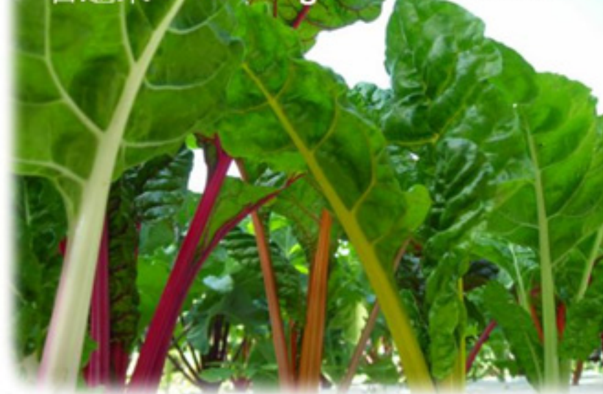
莧菜 Beta vulgaris var. cicla

莧菜（入藥叫出莧蓬兒，譯自波斯文 Chugurdan）、莖菜，以往常用作豬隻的飼料，因此又名豬鬚菜。莧菜是紅菜頭的 cicla 變種，但主要以葉部作食用。葉長達30公分以上，葉柄肥厚多肉，嫩脆多汁，葉片微皺。原產於地中海沿岸、南歐等地。莧菜以色彩豐富見稱，常見的有葉柄為紅色、黃色、橙色或白色的。本地傳統種植的莧菜為全青綠色，葉片較寬，柄也較粗。莧菜生性強健，病蟲害很少發生，是有機蔬菜最理想的菜種。Swiss Chard, a variety of beetroot, has been used as a kind of fodder. The crunchy leaf instead of the root is consumed usually. Native to the Mediterranean, there are many cultivars with attractive stem colours - red, yellow, orange, white, etc. The traditional Swiss Chard grown in Hong Kong has boarder leaves and is green for the whole plant. Swiss Chard is less susceptible to pests. Making it a desirable crop for organic farm.