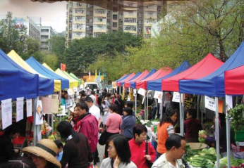
大埔農墟 Tai Po Farmers' Market

People visiting Tai Po Farmers' Market would like to recapture the memories of traditional rural market (Hui). More importantly, their support on local organic agriculture is highlighted when they purchase organic vegetables in Tai Po Farmers' Market.